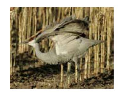
Sandhill Cranes appreciate both the grain and insects found in the fields.