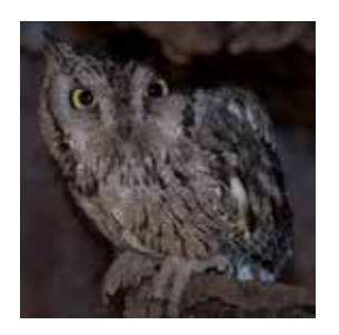
Western Screech-Owl can be a guest in a homemade nest box.